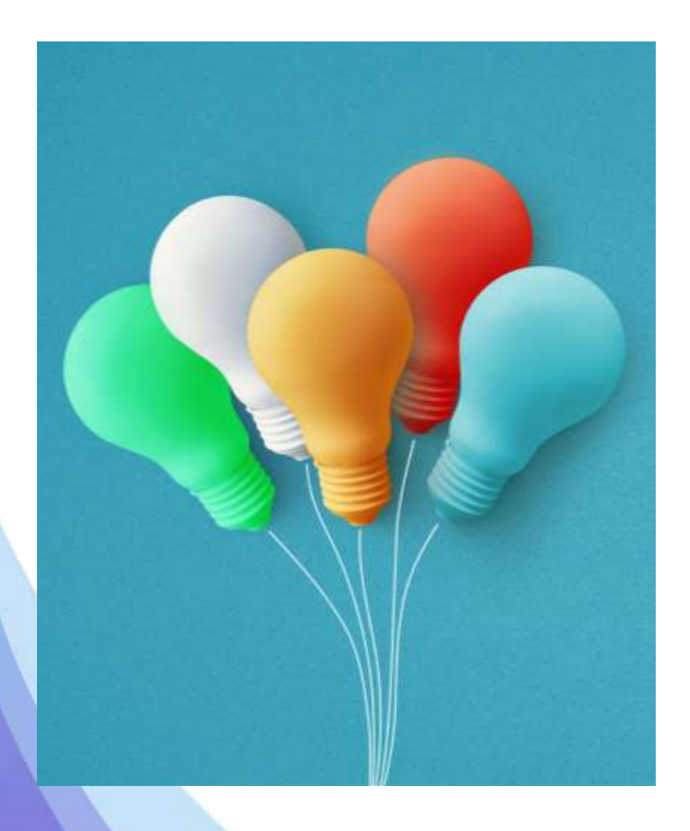
Using a Buddy System